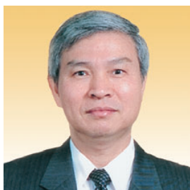
Executive Director Deputy Governor