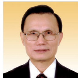
Executive Director Deputy Governor