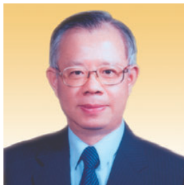
Chairman Board of Directors Governor