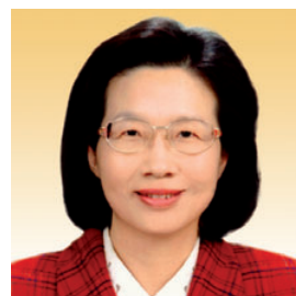
Chairman Board of Supervisors