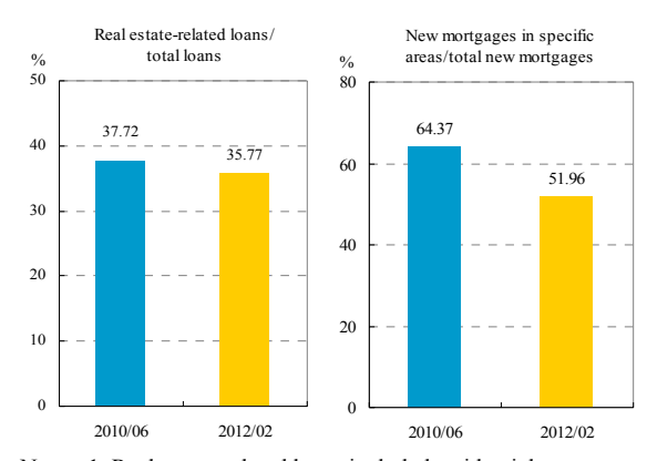
Notes: 1. Real estate-related loans included residential mortgages, house repairs and improvements and loans for construction. Loans of OBUs and overseas branches were excluded.

2. Based on data from domestic banks and local branches of foreign banks.