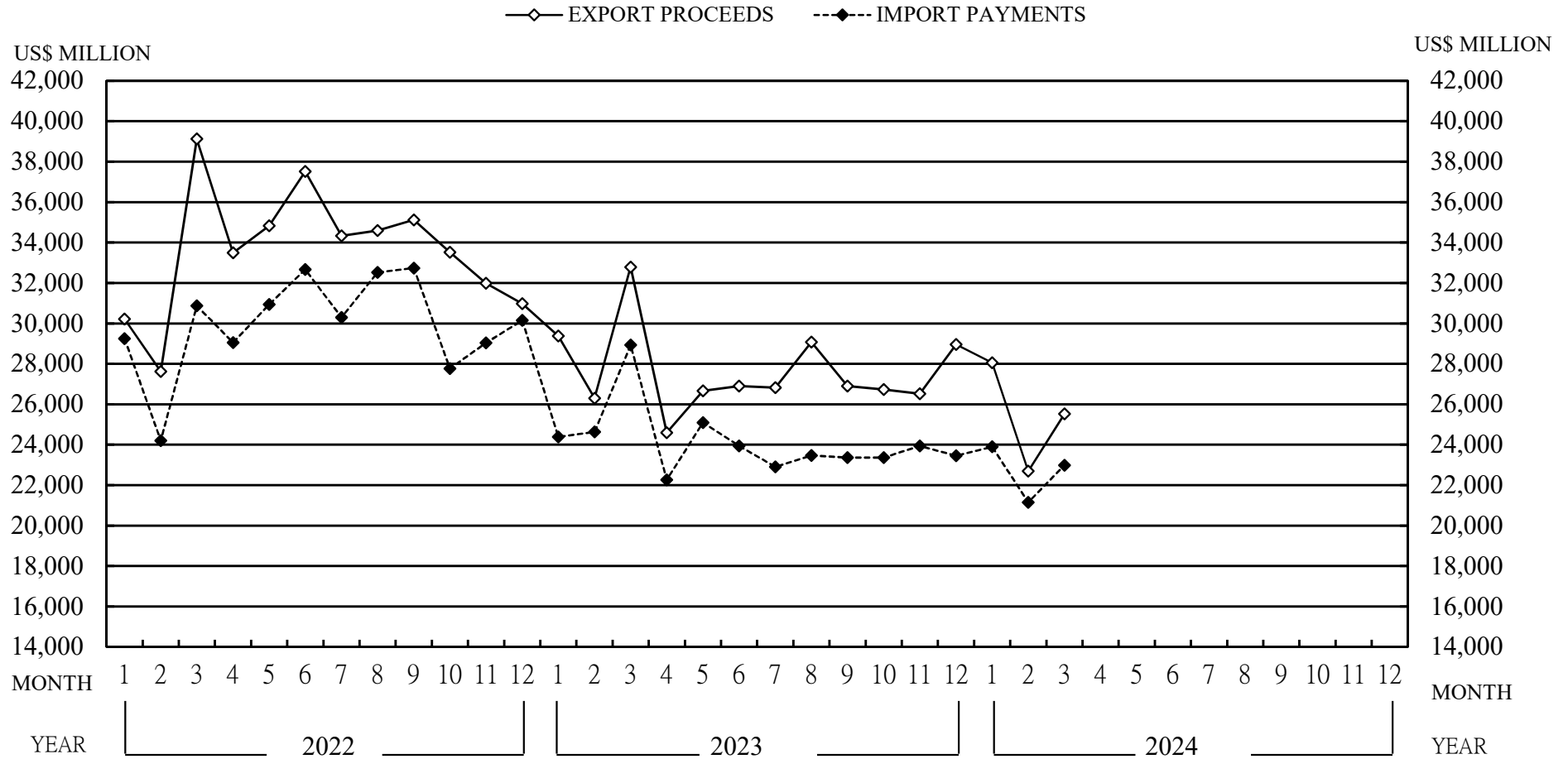
CHART 1 COMPARISON OF FOREIGN EXCHANGE EXPORT PROCEEDS AND IMPORT PAYMENTS (2022-2024)